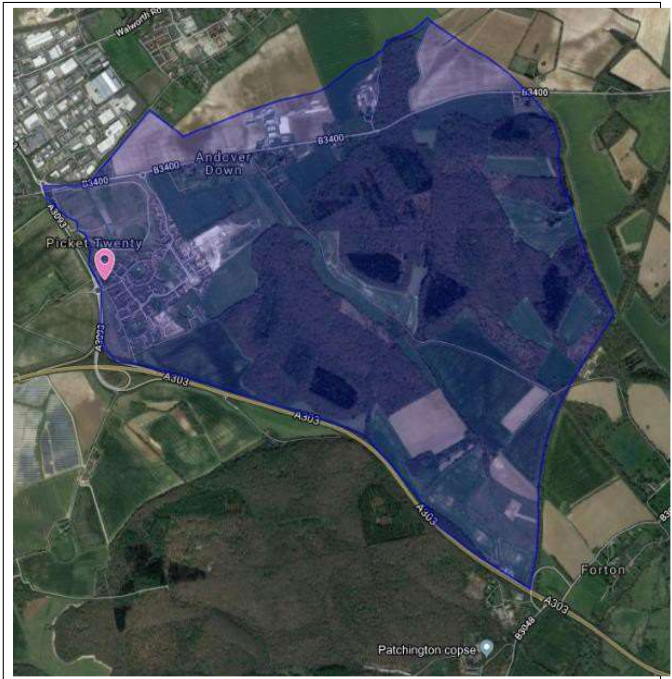
Pilgrims' Cross Catchment Area