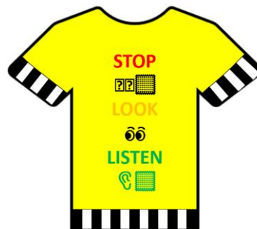
LOLA'S EXAMPLE T-SHIRT