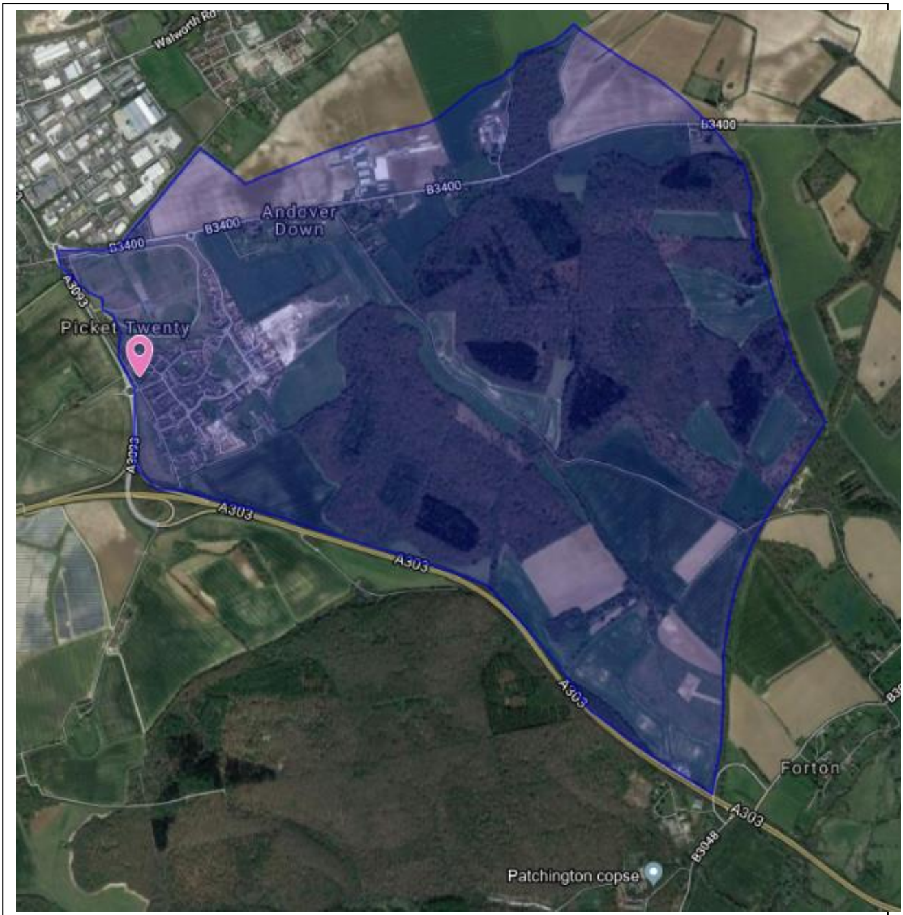
Pilgrims' Cross Catchment Area